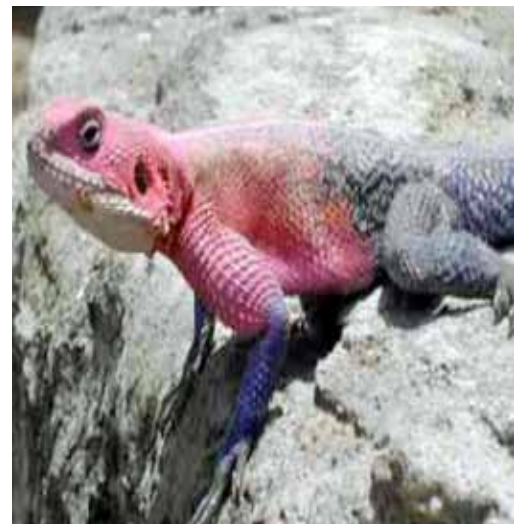
Red-headed Rock Agama ( Lizard )

12 The Horn of Africa also has the continent's highest number of endemic reptiles, alongside a number of endemic and threatened antelopes, such as the gerenuk ( Litocranius walleri ), a species of long-necked antelope found in the dry bushy scrub in the Horn of Africa (Djibouti, Ethiopia, and Somalia), as well as some parts of East Africa, such as Kenya and northeastern Tanzania. Gerenuks are declining in number due to over-hunting, drought, and habitat loss in the case of Somalia.