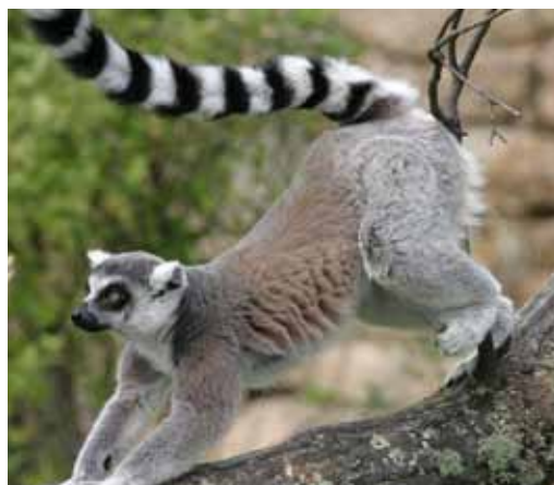
Ring-Tailed Lemur of Madagascar