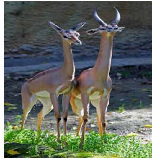
Gerenuk ( Litocranius walleri )

11. In Egypt, some 7 per cent of the country's bird population consists of migratory species which appear on a seasonal basis. The coastal areas of Egypt are situated along extremely important migratory routes for birds and there are very important wintering areas for waterbirds along the coast. The lakes along the Mediterranean shores of Egypt and the country's Bitter Lakes represent some of the most important areas for migrating and wintering waterbirds in the Black Sea and Eastern Mediterranean region (BirdLife International, 2005). Significant concentrations of the world populations of a number of species are also found in these wetlands. Expanding urban, industrial, agricultural and tourism development is now creating hazards to birds in areas where previously they encountered no threats. These new threats include development activities and their related infrastructure; the destruction or degradation of habitats; contamination by pollutants; and the construction of electricity power lines that obstruct avian flyways, causing fatal collisions.