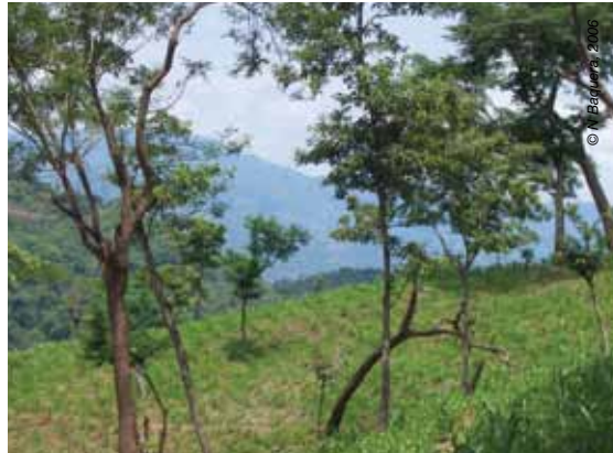
Agro-forestry, Lempira, Honduras

In remote villages of hilly southwest Honduras, local farmers have an age-old trick to protect their crops from hurricanes. Thousands of resource-poor farmers have readopted and adapted traditional farming techniques which have substantially improved their livelihoods and provide them with multiple benefits and at the same time successfully reduced impacts of natural disasters.