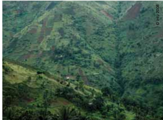
Bururi Province, Burundi