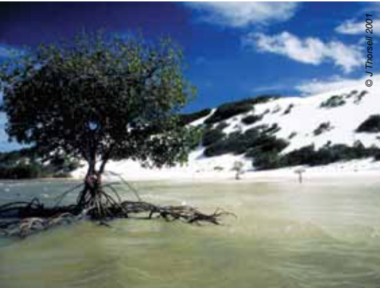
Shelburne Bay, Great Barrier Reef Heritage Area, Australia

Ecosystems contribute to reducing the risk of disasters in multiple and varied ways. Well-managed ecosystems can reduce the impact of many natural hazards, such as landslides, flooding, avalanches and storm surges. The extent to which an ecosystem will buffer against extreme events will depend on an ecosystem's health and the intensity of the event. Degraded ecosystems can sometimes still play a buffering role, although to a much lesser extent than fully functioning ecosystems.