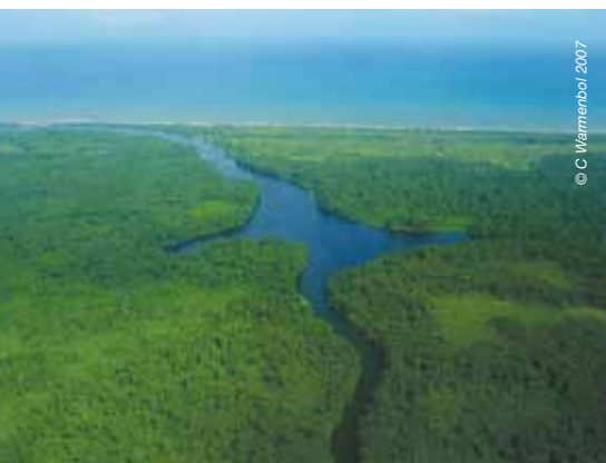
El Cangreca river, Honduras

Environmental Vulnerability Index (2004)