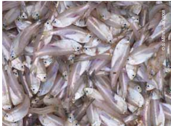
Sprats, Sri Lanka