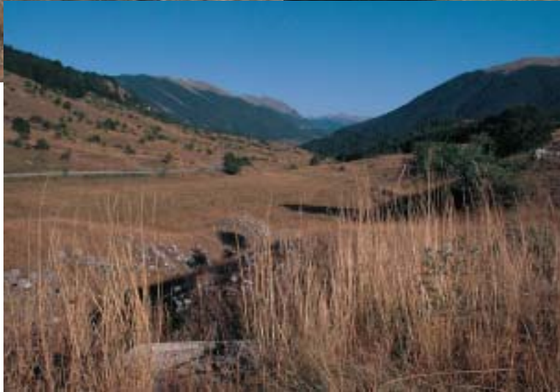
◀ The Park has large areas of grassland, as well as forests on the valley sides.

Directors of the Park officially approved the agreements with the villages that had been made, an agreement that was later approved by the relevant ministries in Rome. However, the Park retains the right to override the agreed zonation with stricter limitations where needed. It can also increase the level of protection by indirect means, notably the closing of public roads in sensitive areas.