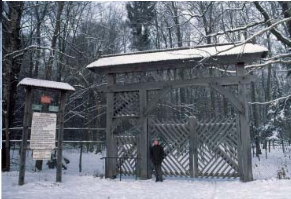
▲ The historic gate into the strictly protected part of the forest.

Strenuous efforts to extend the National Park over all the Bialowieza forest in Poland have not yet borne fruit. The Polish Government contemplated a large expansion only a few years ago, and went so far as to invest in a massive new set of buildings for the Park, including a very large exhibition space, a lecture theatre and a new headquarters building, but at the last minute, in 2000, changed its mind and left the situation as it was. The forestry lobby is very strong in Poland, reflecting the economic importance of forestry to the country, and it was reported that local communities were not all in support of the park extension fearing loss of livelihoods. However some good has come out of this disappointing result: in 1994 the Ministry of Environment developed a system of forest management (called in English 'Forest Promotional Complex') that is more sustainable than other forms of forestry. State foresters are trying this out in the Bialowieza Forest outside the Park. This experience is being used as a laboratory for making forest management elsewhere in Poland more sustainable. In the year 2004 there are as many as 11 Forest Promotional Complexes scattered across the country.