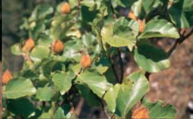
◀ Beech ( Fagus sylvatica ) is one of the characteristic species of the Park.