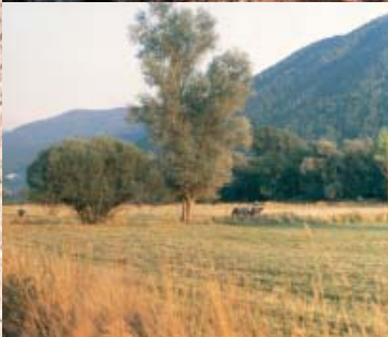
▲ Zone C is a small part of the park, containing land farmed in traditional ways.