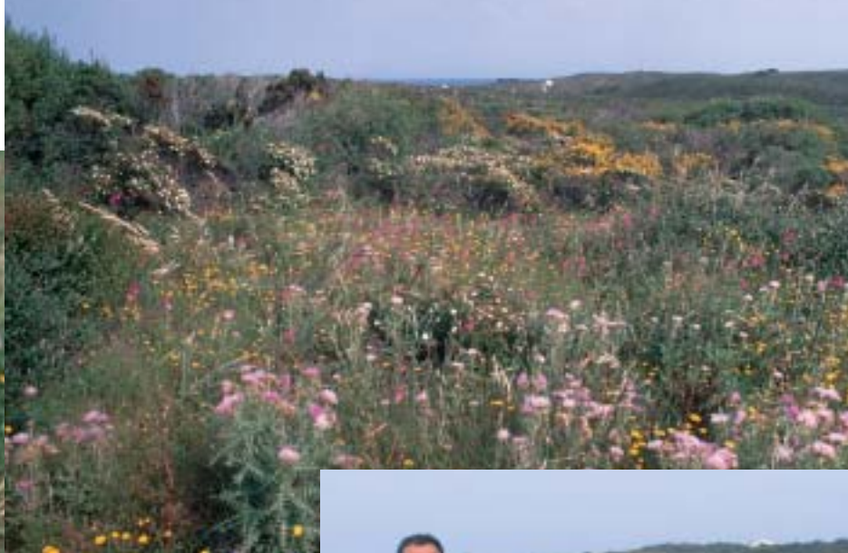
▲ Wild flowers delight the visitor in spring.