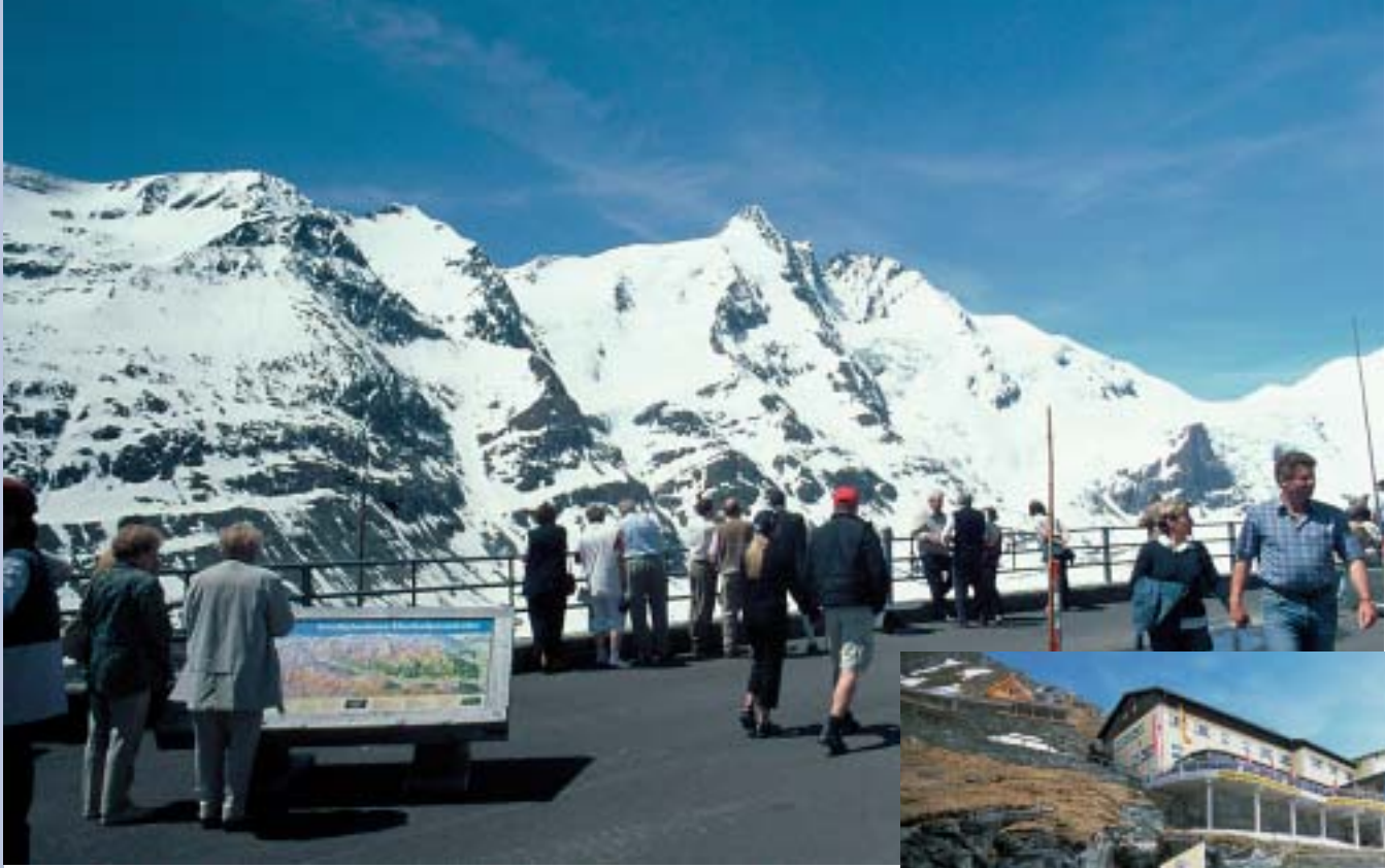
▲ Tourists admire the view at the Franz-Josefs-Höhe, the end of the spur from the High Alpine Road.