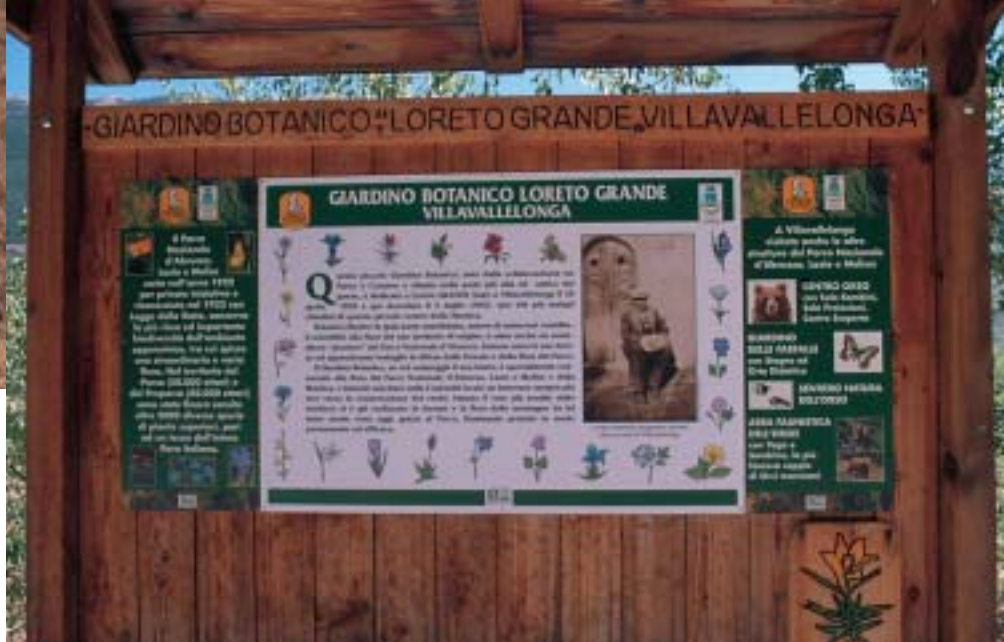
▶ Well-made signs keep the visitor informed, in this case of a local botanic garden at Villavallelonga.