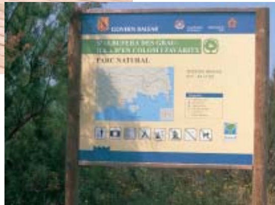
▲ Signing at Albufera Natural Park.