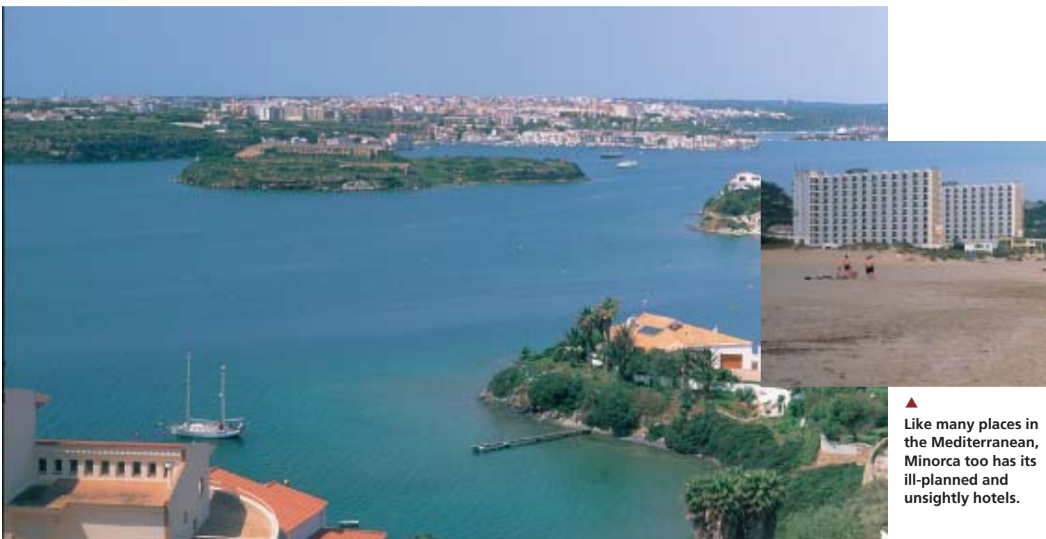
▲ Like many places in the Mediterranean, Minorca too has its ill-planned and unsightly hotels.