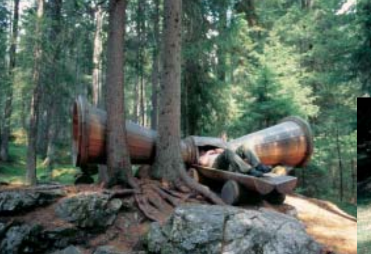
▲ Children can listen to amplified sounds of nature on this extraordinary device, on the visitors trail near Kals.