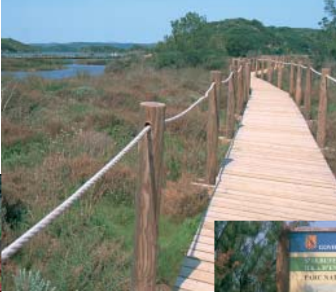
◀ A path for visitors at the Albufera Natural Park.