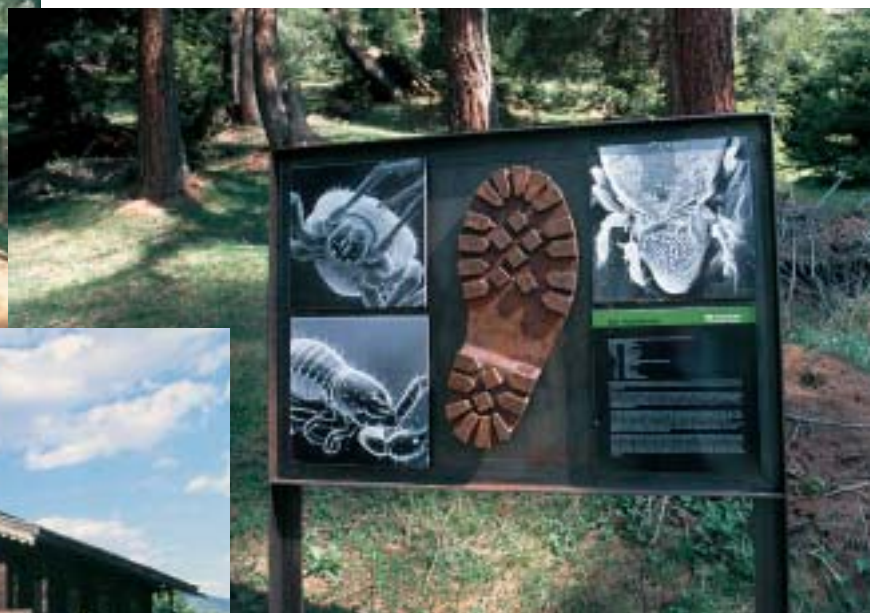
▲ Displays on the trail at Zedlacher Paradies show the effect of a boot on a microscopic life.

Another impressive trail is one created for children near the beautiful village of Kals. Also well outside the Park, it includes a series of innovative exhibits to encourage children to appreciate nature and to stimulate parents to tell their children about nature. For example a device like a giant double foghorn allows a child to hear the sounds of nature amplified; a small merry-go-round enables children to look up and see silhouettes of various birds, while the father or mother rotates the device and provides the commentary. Amazingly, too, after eight years, none of the devices have been vandalized, a tribute both to Austrian children and to the inspiring nature of the devices. This is an approach that many other parks could take.