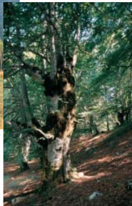
▶ Abruzzo has some of the oldest trees in Italy, some like this one pollarded for centuries.

see the Park as their opportunity for the future; if so the villagers will then be willing to accept controls in other zones. Thus Tassi believes it is essential for the Park to have the so-called development zone, not only the more conventional conservation zones.