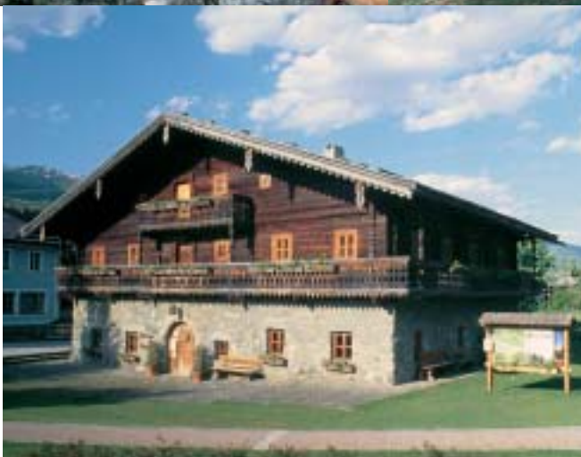
▲ The historic Klausnerhaus (Nature House) in Hollersbach.