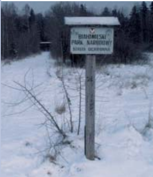
▲ Few visitors come in winter, and on some days it is too cold even for staff to work in the forest. The author could take only these two pictures before his camera froze! Above, a sign to the forest.