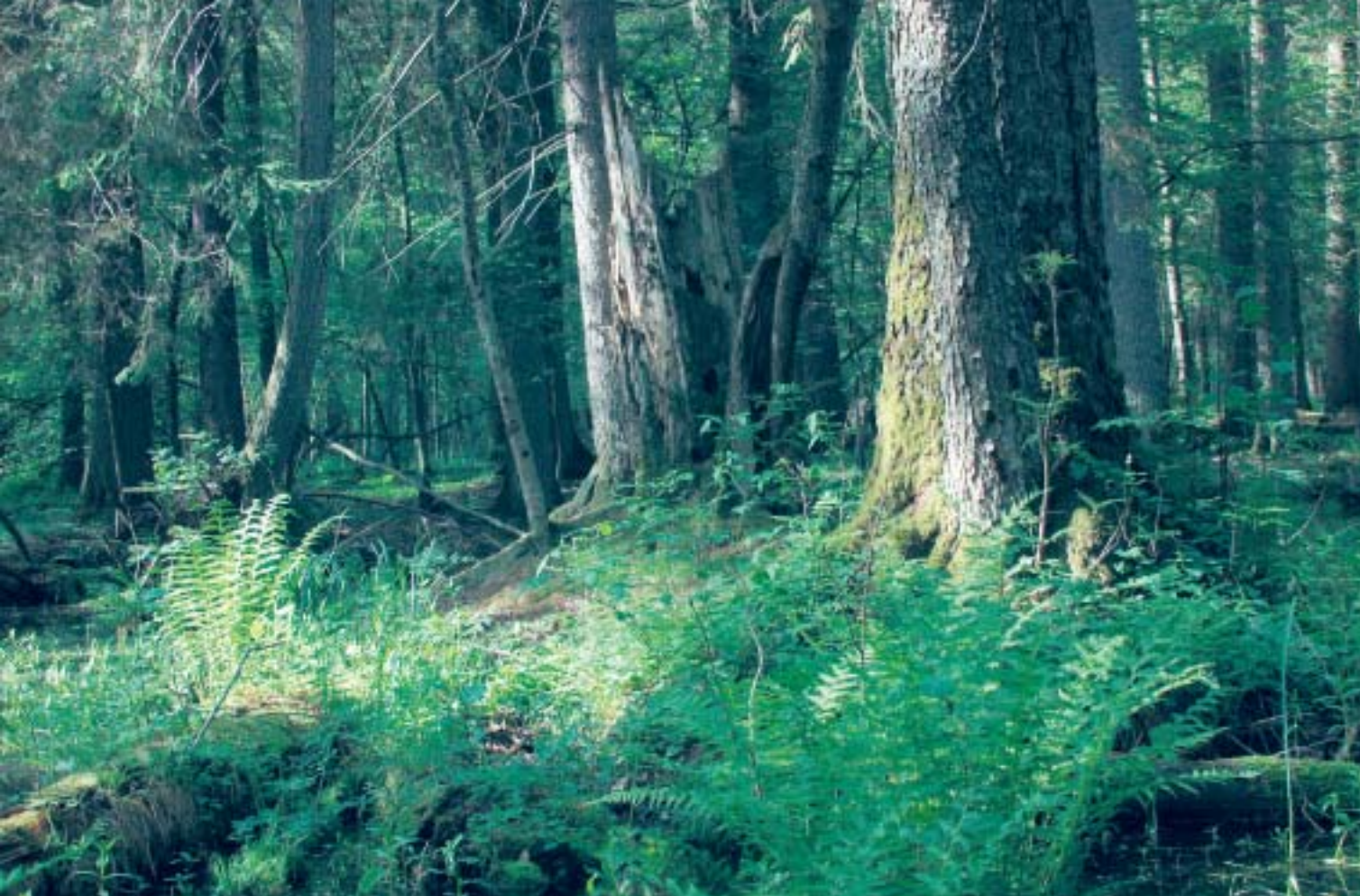
A rich fern flora is characteristic of long-established forest.

conservative line about disturbance that could be caused to the forest; for example it recently forbade new meteorological instruments in the forest because of the need to install a cable. Everything has to be discussed first. At present some 65 research projects are authorized each year, of which 18 are long-term.