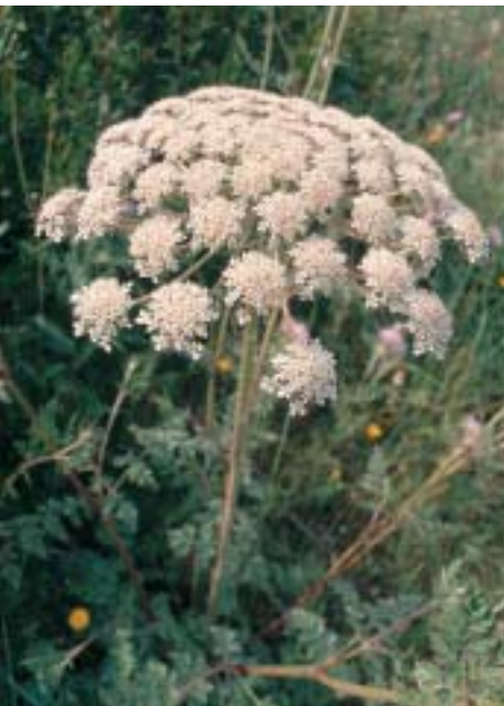
▲ The wild carrot ( Daucus carota ), part of the rich plant genetic resources of Minorca.