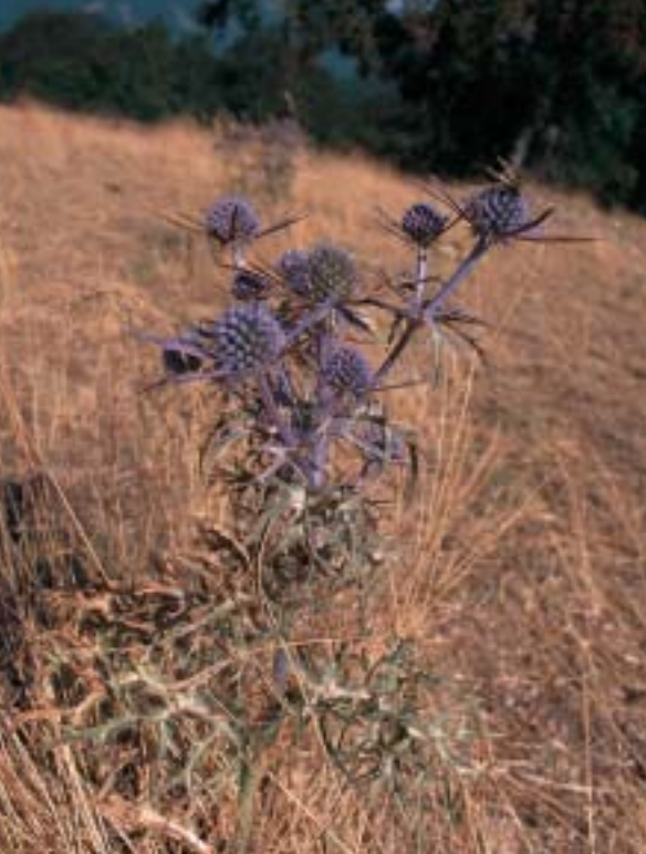
▲ A blue-flowered species of Eryngium delights the visitor in spring.