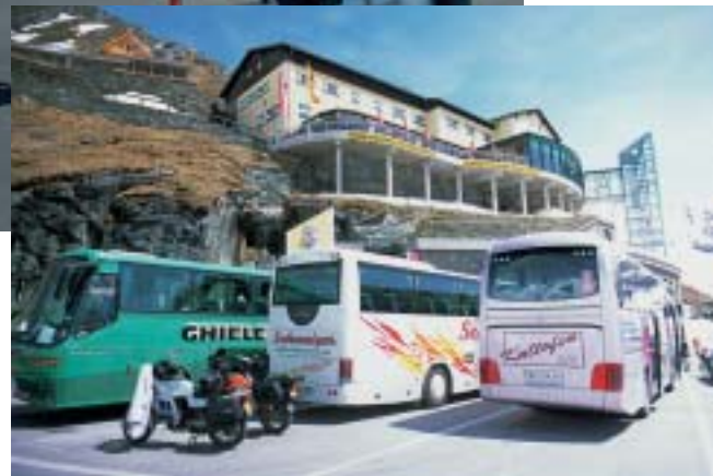
► Buses at Franz-Josefs-Höhe add to pollution and congestion.

goes to the Finance Ministry, not the Park. Around 900,000 visitors take the Road each year, down from a peak of 1.3 million in the early 1990s.