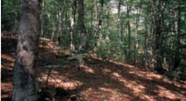
◀ Dense woods, mainly of beech, clothe the valley sides.