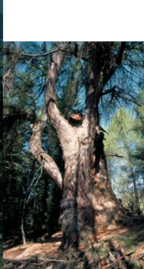
▲ The famous ancient larch trees of Zedlacher Paradies.