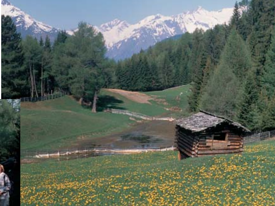
▲ An alpine meadow near Zedlacher Paradies.