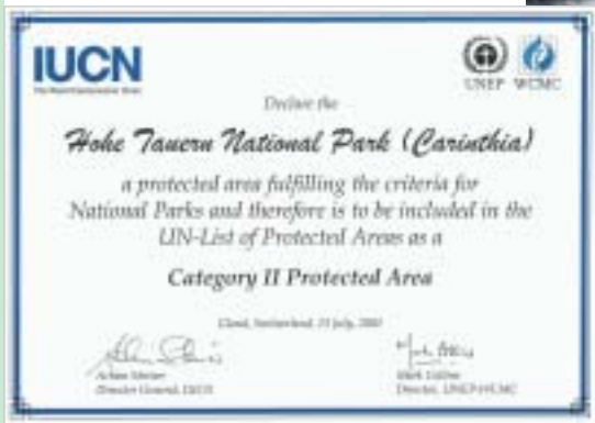
◀ Hohe Tauern is a Category II site in the UN List of Protected Areas.