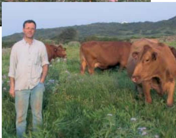
▶ A farmer with his herd of indigenous cows.

The people of Minorca (Menorquins) are hardworking, hospitable, strongly attached to their local history and traditions. During local festivities the whole island becomes alive with traditional music and a local race of horses (wonderful black-coated animals) is exhibited in races, parades, games and pure pleasure runs throughout the narrow streets of every town and village in the island. In all, the local society of about 70,000 residents, mainly in the traditional port and historic harbour of Maó (Mahón) on the east coast and the former island capital of Ciutadella in the west, is rather closely knit, but tourism is rapidly affecting its character.