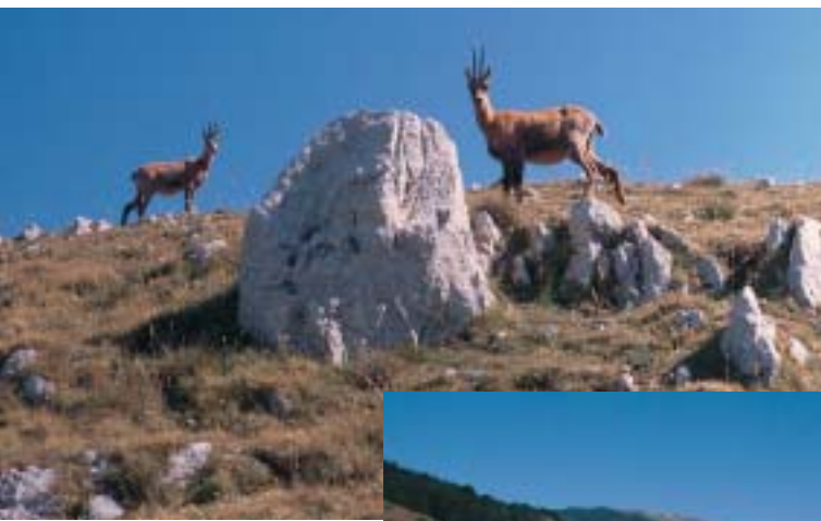
▲ Abruzzo has a rich fauna including chamois (above), wolf, lynx and bear.

Part of Zone B, the General Reserve that covers most of the Park.