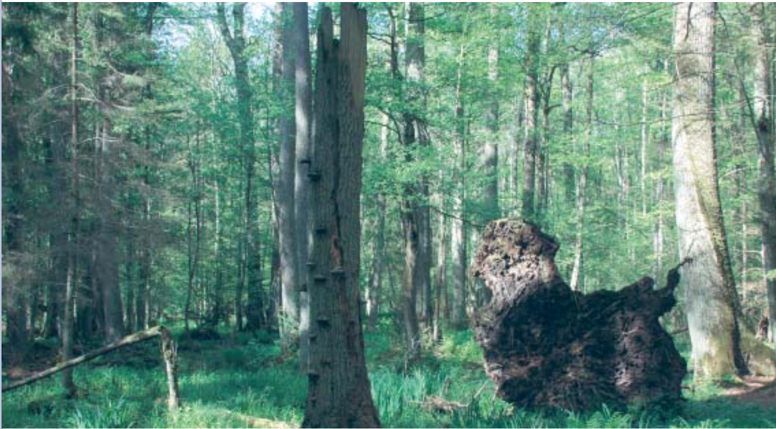
The forest shows trees in a range of age classes, a sign that it has not been felled.

tion to which genetic studies are contributing. There are also research programmes on wolves, lynxes, badgers, foxes, pine martens, polecats and bats.