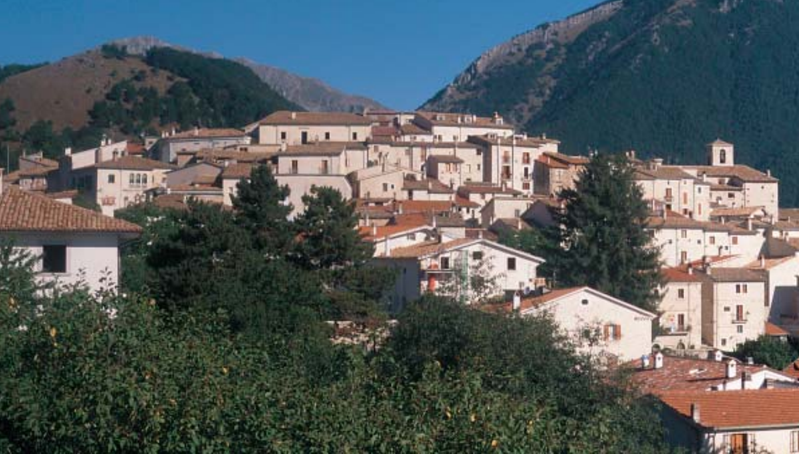
Zone D contains the villages, including Civitella Alfedena and Opi, above.

The buffer zone should also be included here. Abruzzo National Park has grown up over many years and its boundaries are the result of history and opportunity, rather than ecology. A large buffer zone of 60,000 ha was added in 1970, which has a much more ecological outer boundary. The park authority hope that eventually all the buffer zone will be in the Park proper, so making corridors into the wider countryside not just for nature but also for culture and ideas. Since 1988, the Park has legal rights to regulate hunting in the existing buffer zone – vital for a Park in which large mammals are the main attraction.