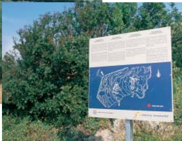
▶ Archaeological sites are protected as well as natural areas.

Obtaining the declaration may not have been too onerous, but the difficult part was to make it meaningful and effective. A BR Consortium, uniting all the stakeholder representatives interested in offering support and ideas, was created but was less successful than hoped. Its deliberations – supposed to be by consensus – were blocked by one of the farm-owner associations. In 1995 the Parliament Balear enhanced the biosphere reserve by establishing the Albufera Nature Park of some 1,947 ha, which protects a large lagoon and surrounding hillsides and farmland in the northeast.