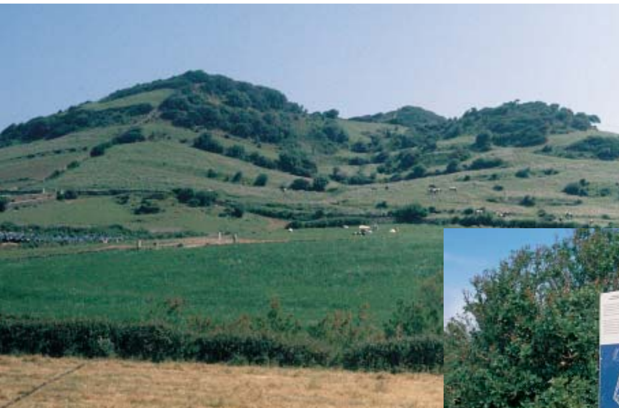
◀ The typical landscape of Minorca, a mosaic of fields and wooded hillsides.