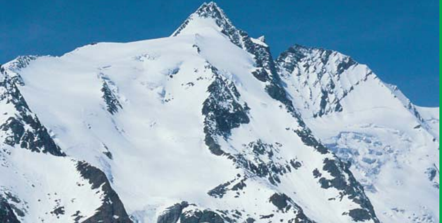
The spectacular peak of Großglockner.

T ourism is at the heart of most national park strategies. But it brings perils as well as benefits. Visitor management is how the park manager seeks to maximize the benefits and minimize the harm.